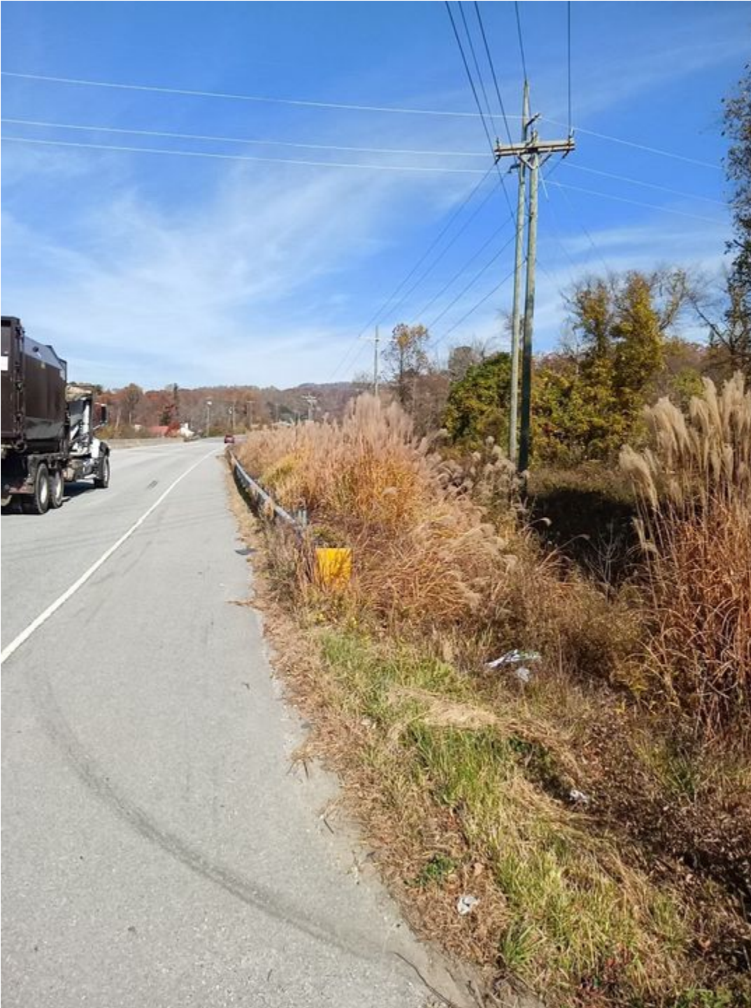
Date & Time: November 7, 2025 12:20 PM Location: 35.372105, -82.47741 Photo Direction: North